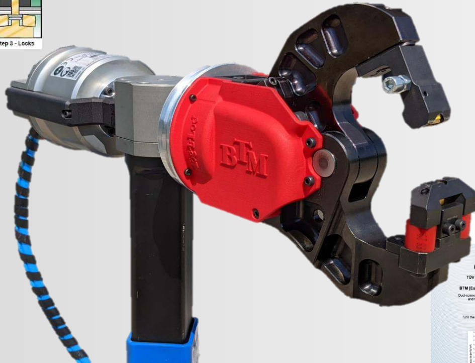
Clinching Unit HHP – RS Fast-Clever-Ergonomic